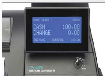
• 8 Line Blue Backlit, Graphic Liquid Crystal Display.

Bar Code Scanning Add a bar code scanner to any of the ER-500 Models. Charge the customer the correct price every time.