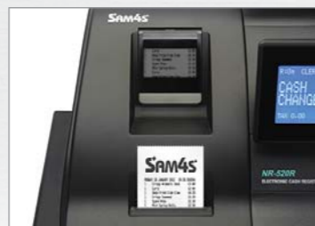
• Single & Twin Station Thermal Printers.