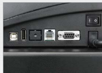
• 2 x Serial Ports & 1 x Type A & 1 x Type B USB Port.