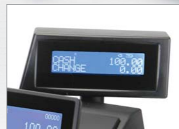
• 2 x Lines x 16 Character Rear Customer Display.

NR-510R RAISED KEYBOARD & SINGLE STATION PRINTING.