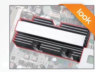
Clean, Quiet Fan Free Design.